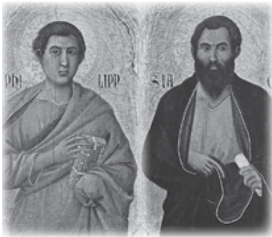
Ss. Philip and James. Detail of the altarpiece by Duccio in the Siena Cathedral, Italy