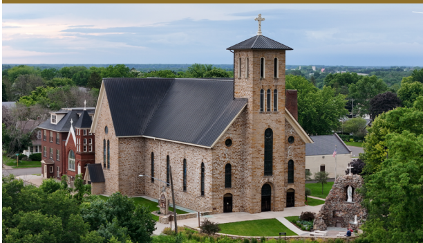
NOTRE DAME | 117 Allen St