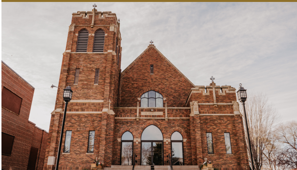
HOLY GHOST | 412 South Main St