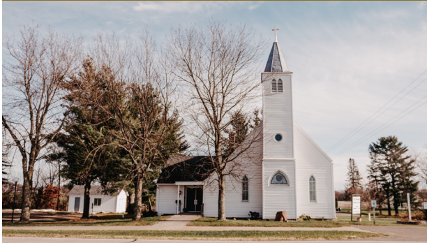
ST. BRIDGET | 2801 N 110th Ave