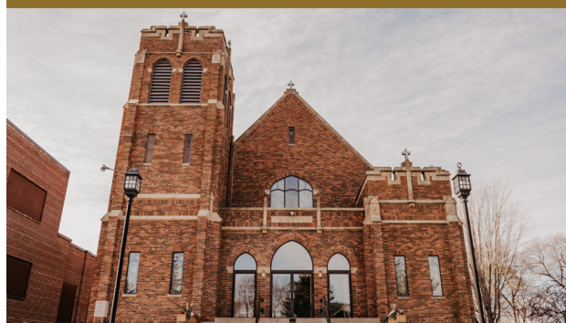
HOLY GHOST | 412 South Main St