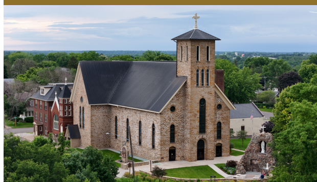
NOTRE DAME | 117 Allen St