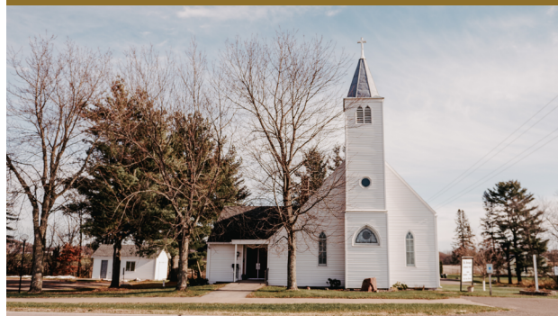
ST. BRIDGET | 2801 N 110th Ave